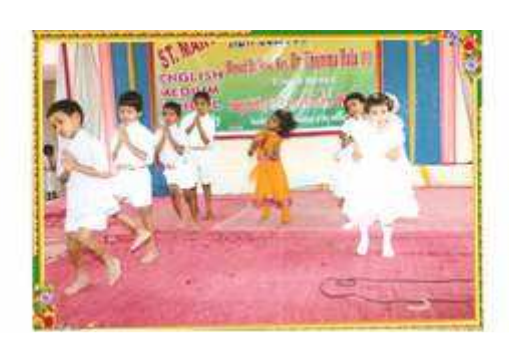
Cultural programme by the children